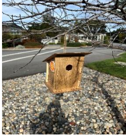
Sample Birdhouse hanging on the tree in front of the Clubhouse!

COMING IN MARCH, BIRD MAKING CLASS.....MORE INFO. TO COME!